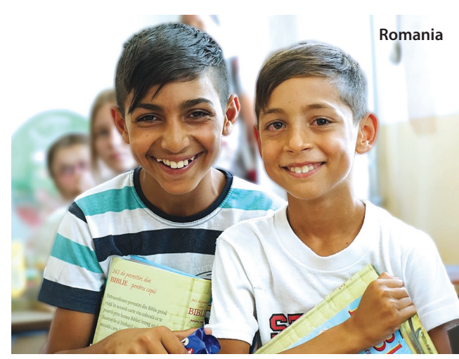
'The fear of the Lord is a fountain of life, To turn one away from the snares of death.' Proverbs 14:27 (NKJV)

To live well comes from a consistent flow of wise decisions that bear lasting fruit.